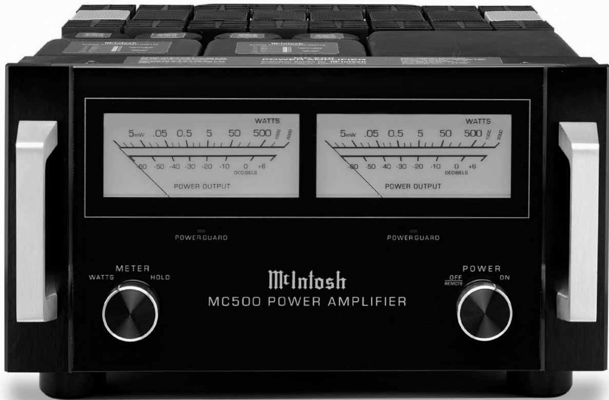
MC 500 POWER AMPLIFIER