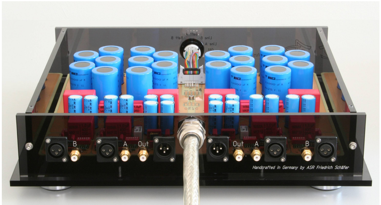
Basis Exclusive with 2 inputs