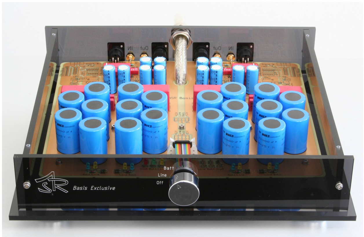
Basis Exclusive with one input