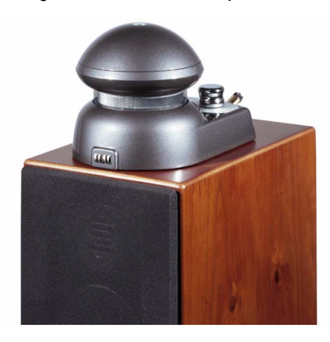
New 4 PI PLUS.2 on bookshelf speaker BS 204.2