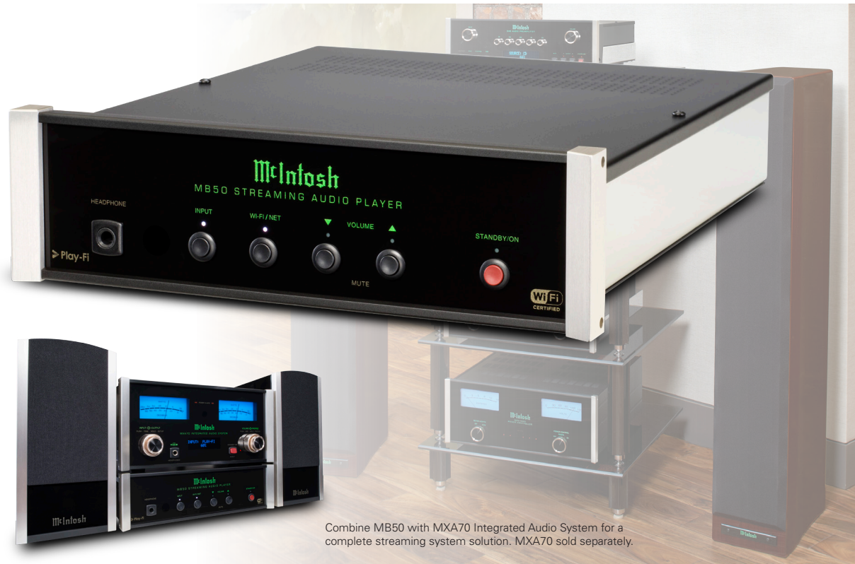
Combine MB50 with MXA70 Integrated Audio System for a complete streaming system solution. MXA70 sold separately.

1. All services may not be available in all regions; certain services may not yet be enabled for all apps; subscriptions may be required. List subject to change.